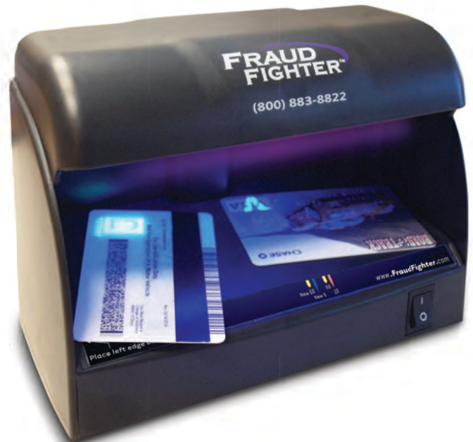
With Fraud Fighter™ Verification